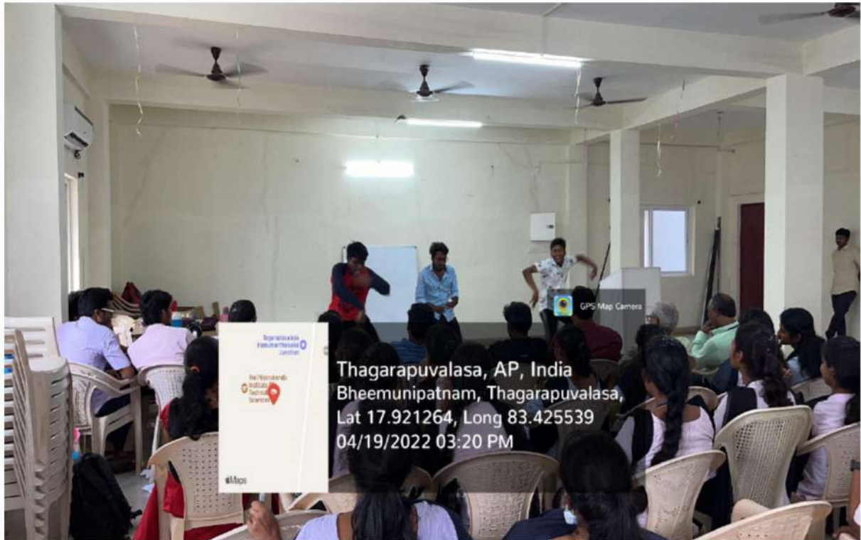
Dance performance by boys