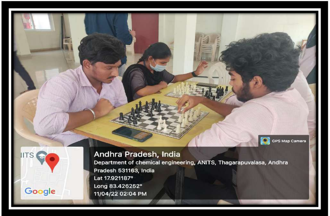
Chess For Both Boys & Girls