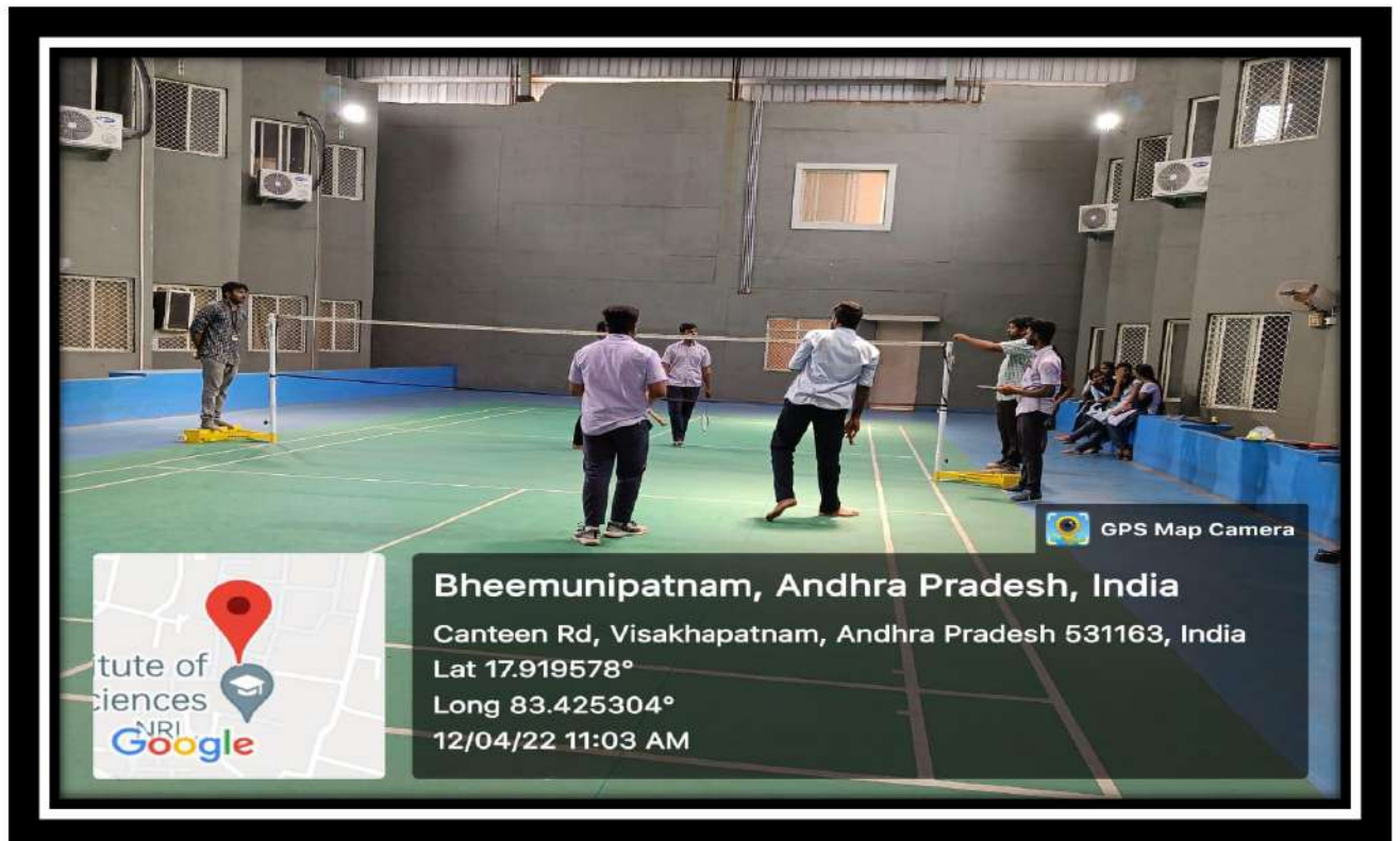
Shuttle Doubles for Girls