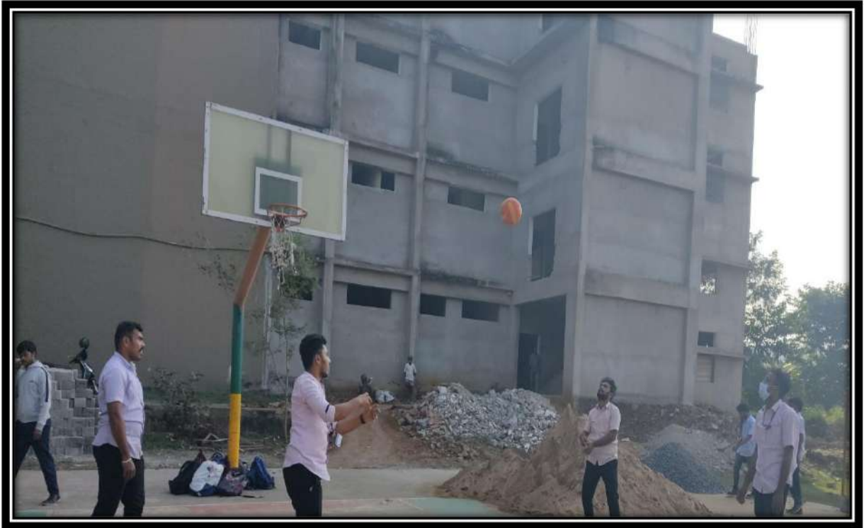
Basket Ball for Boys