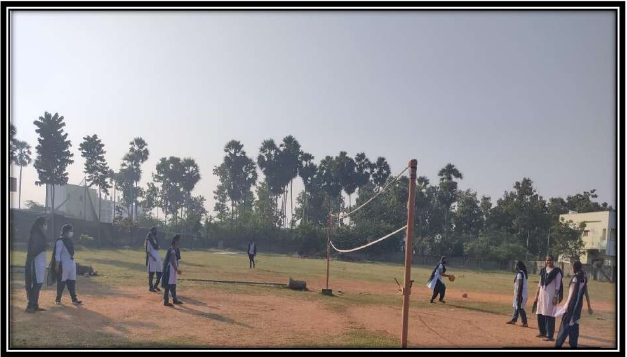
Throw Ball for Girls