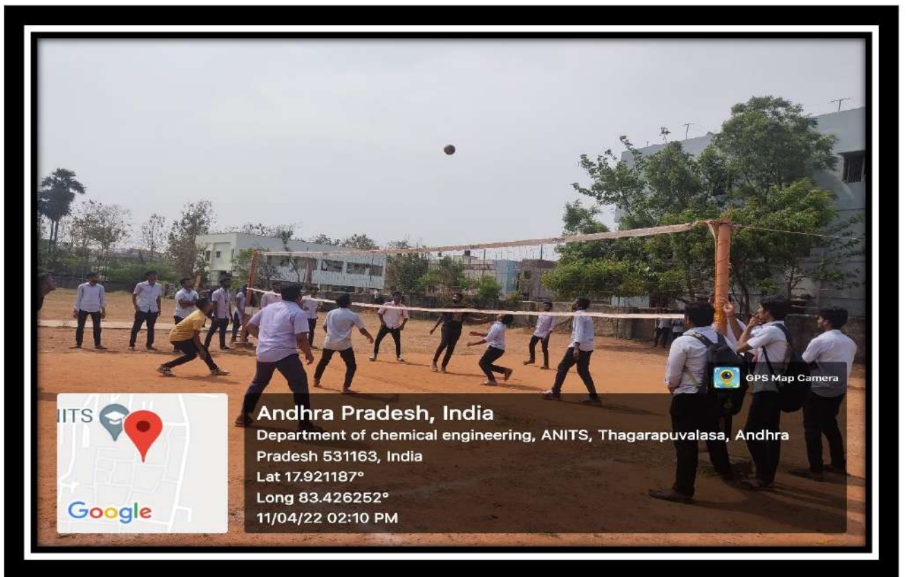
Volley ball Game for Boys